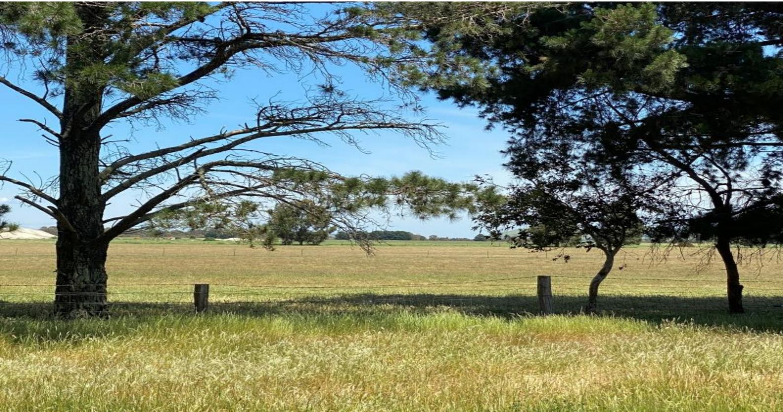
CRESWICK NORTH GP31